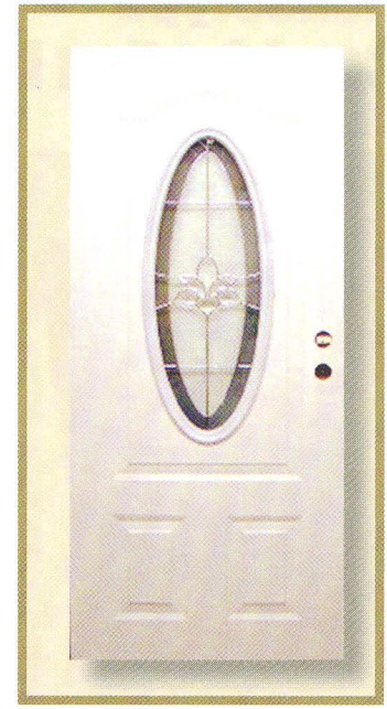
3/4 Oval Light Door

Doors with windows below are drilled for deadbolt. All other stocked 6 panel doors have knocker, viewer and drilled for a dead bolt.